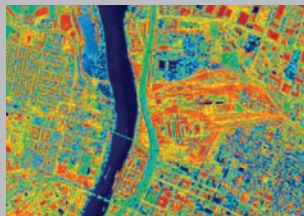
Sacramento, CA (Thermal)

Colors indicate Hot Spots in Urban Areas