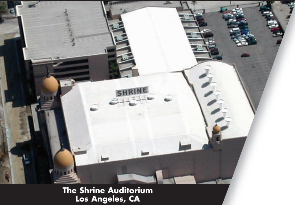
The Shrine Auditorium Los Angeles, CA

APOC is the industry leader in Cool Roof Solutions for Building Owners, Facility Managers and Property Management companies. As the commercial roofing division of Gardner Industries, APOC has extensive knowledge, experience and technology that date back to the invention of asphalt roof cement in 1913 and reflective coatings in the 1920's. Over the decades, we have utilized this knowledge and technical expertise to formulate the highest quality products in the industry. This has resulted with APOC's reputation as, "The Choice of Top Professionals". (APOC has the highest independently rated products in the industry. See the results @ www.coolroofs.org < http://www.coolroofs.org >).