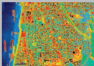
Baton Rouge, LA (Thermal)