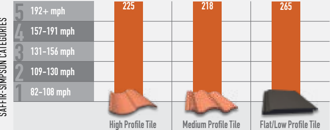
ASCE 7-10 Wind Design Standard. Exposure C, 30 foot mean roof height, Large paddy, Importance factor 1.00, High Profile based on a tile factor of 1,407, 2:12 to 6:12 slope, gable/hip roofs.

GUST WIND SPEED OVER LAND (3-SECOND GUST) WITH EQUIVALENT SAFFIR-SIMPSON CATEGORIES