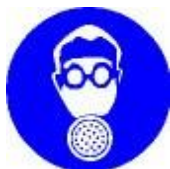
Combination filter A-P2

Recommended filter device for short term use: