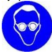
Tightly sealed safety glasses.

· Body protection: Protective work clothing.