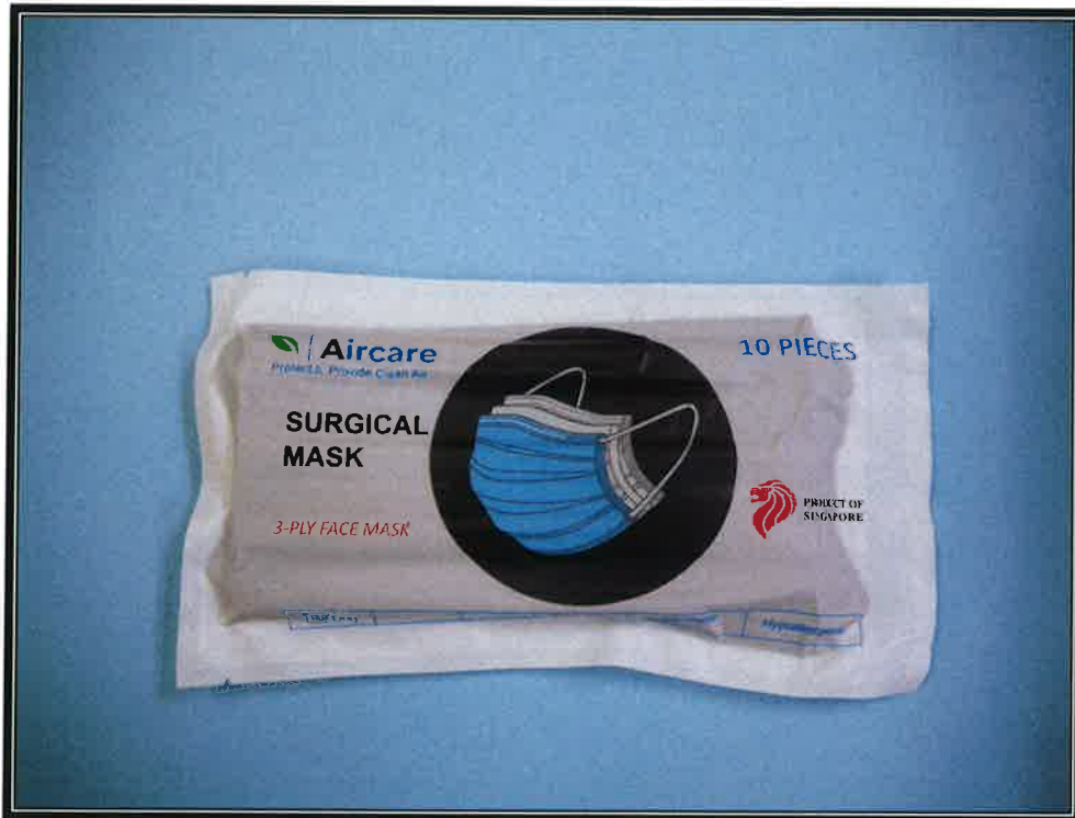
Photograph 1 Granzilla Aircare 3 ply disposable face mask (Black) as received