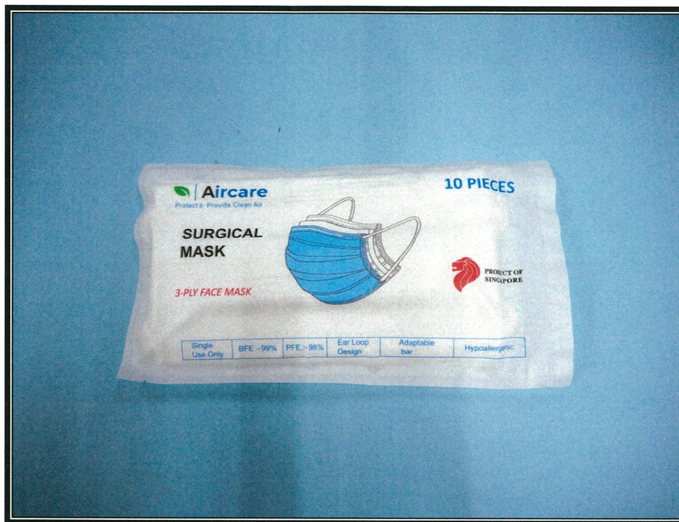
Photograph 1 Granzilla Aircare 3 ply disposable face mask (Black/White) as received