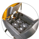
Recovery tank with gas spring