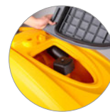
Debris tray + vacuum filter