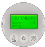
Password for reliability and ease of use