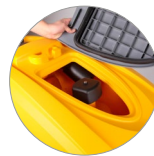
Debris tray + vacuum filter