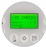
Password for reliability and ease of use