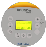
Control panel with display