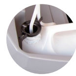
Chemical mixing system