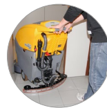
Adjustable and compact squeegee