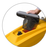
Removable lid + floating ball + filter