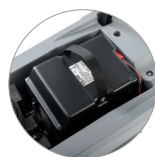
Kit Hybrid (for Hybrid version)