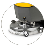
External wheel, adjustable pressure