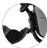
Foot pedal squeegee lifting system