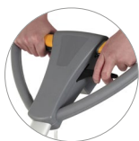
New ergonomic Handle