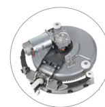
Squeegee and rotation (up to 270° rotation)