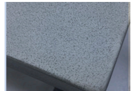
The small scratches are almost removed

It is important that the table is immediately cleaned if spills occur. Otherwise, there may be spots and blotches. DuralCrete should not be exposed to acid or acidic products; including red wine, juice, lemon, etc. as these may cause stains if it is not immediately removed. DuralCrete must not be exposed to very hot or very cold items, as condensation may form by prolonged exposure, therefore, always use a place mat. Grease and dirt on the table top can cause stains and the effect of the sealer can be broken down.