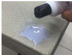
Distribute the DuralCrete protection equally on the surface, using a soft cloth.