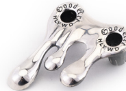
DRIPPING DOUBLE EYELET STERLING SILVER $165.00 each $2665.00 each - 22k