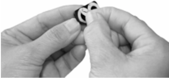
Step 1 Peel-off backing film of the adhesive tape