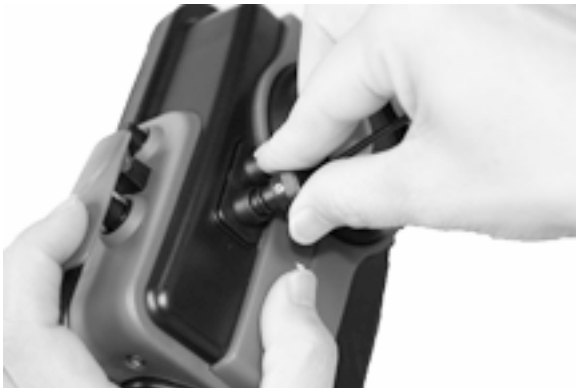
Step 3 Plug the Optic Cable Jacks into the connector holes