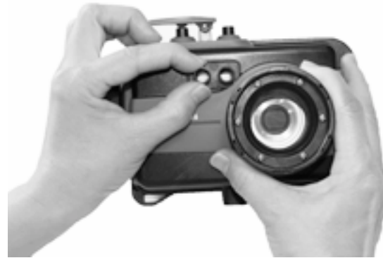
Step 2 Gently press and fit the Connector base onto the camera flash window