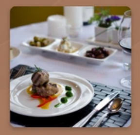
MADE FOR HOSPITALITY

Proven in restaurants, excelling through the rigors of everyday use such as: commercial grade dishwashers, salamander broilers