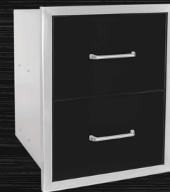
DOUBLE DRAWER 16" X 22" 304 BLACK STAINLESS