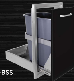
PULL OUT TRASH DRAWER 14" X 26" 304 BLACK STAINLESS