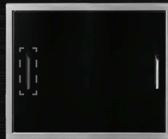
HORIZONTAL SINGLE DOOR 27" X 20" 304 BLACK STAINLESS