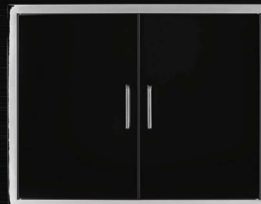
DOUBLE DOOR 38" X 24" 304 BLACK STAINLESS