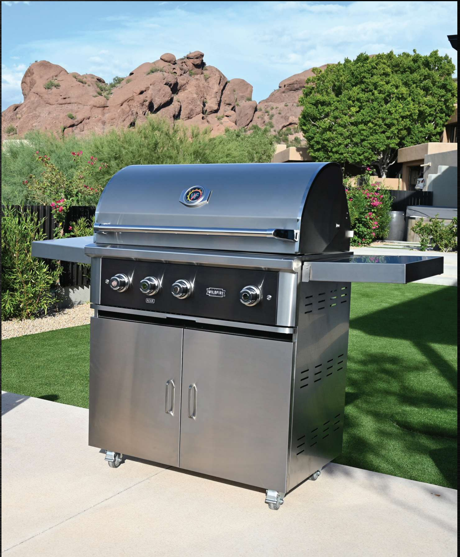
36" GRILL with STAINLESS STEEL CART WF-PRO36G-RH and WF-CART36-CGG