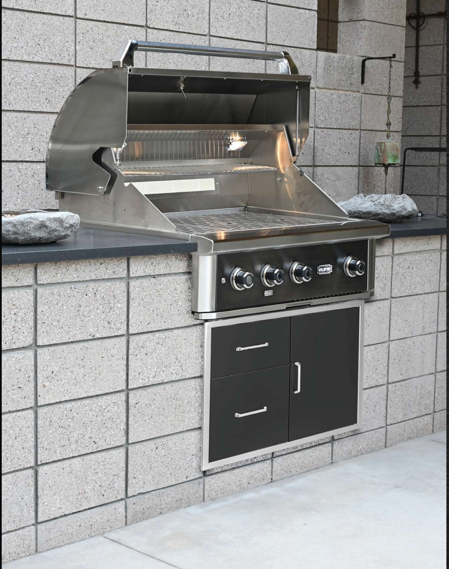
36" GRILL with DOOR / DRAWER COMBO 30" x 24" RANCH WF-PR036G-RH-(NG/LP) and WF-DDWCOMB03024-BSS