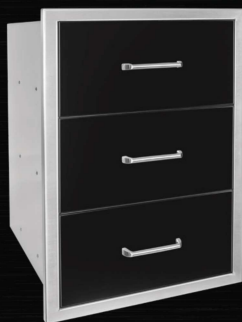
TRIPLE DRAWER 19" X 26" 304 BLACK STAINLESS