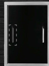
VERTICAL SINGLE DOOR 20" X 27" 304 BLACK STAINLESS