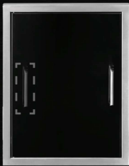
VERTICAL SINGLE DOOR 16" X 22" 304 BLACK STAINLESS

From black stainless steel doors and drawers to built-in ice chests and outdoor refrigeration – Wildfire’s accessories have everything you need to transform your outdoor kitchen into an entertaining oasis.