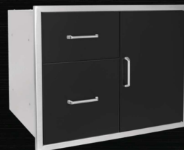
DOOR / DRAWER COMBO 30" X 24" 304 BLACK STAINLESS