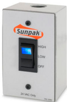
Switch provides easy control of the Sunpak S34-TSH

Since it's conception in 1984 the Sunpak® heater has proven itself to be an essential element to the year-a-round commercial patio. Sunpak® heaters can effectively heat outdoors because they warm people with infrared radiant heat instead of hot air. Radiant heat warms people and objects such as tables, chairs and floor directly without heating the intervening air. Unlike ultraviolet light, infrared does not cause cancer and will not attract insects. Turn the heaters on to HIGH-heat to warm up a chilled patio and adjust the heaters down to LOW-heat as your guests get comfortable. Proper patio layout and design are important with any patio heating system. We always recommend working with a professional installer to optimize your patio heating system. Each Sunpak® heater is CSA designed certified to rigid ANSI standards. Infrared Dynamics of California is proud to be the manufacturer of Sunpak®.