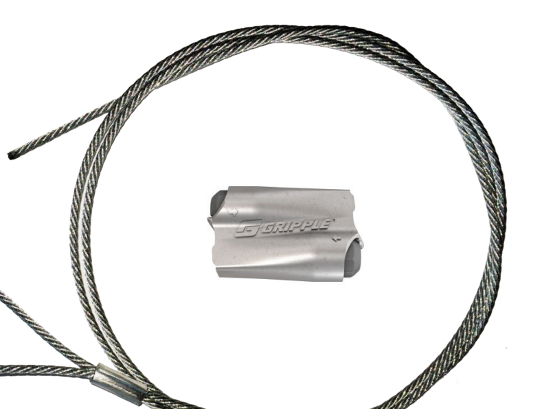
Part #: JL-0800-GR-B