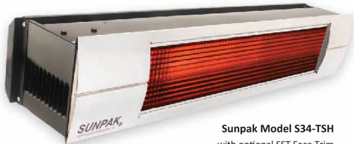
Sunpak Model S34-TSH with optional SST Face Trim