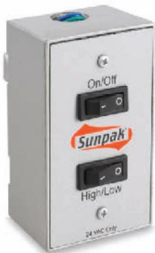
Switch provides easy control of the Sunpak S34-TSH

Since its conception in 1984 the Sunpak® heater has proven itself to be an essential element to the year-a-round commercial patio. Sunpak® heaters can effectively heat outdoors because they warm people with infrared radiant heat instead of hot air. Radiant heat warms people and objects such as tables, chairs and floor directly without heating the intervening air. Unlike ultraviolet light, infrared does not cause cancer and will not attract insects. Turn the heaters on to HIGH-heat to warm up a chilled patio and adjust the heaters down to LOW-heat as your guests get comfortable. Proper patio layout and design are important with any patio heating system. We always recommend working with a professional installer to optimize your patio heating system. Each Sunpak® heater is CSA designed certified to rigid ANSI standards. Infrared Dynamics of California is proud to be the manufacturer of Sunpak®.