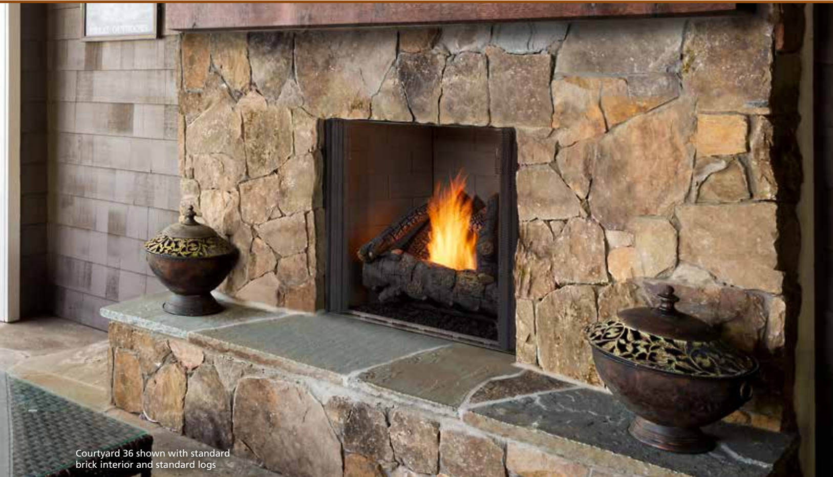
Courtyard 36 shown with standard brick interior and standard logs