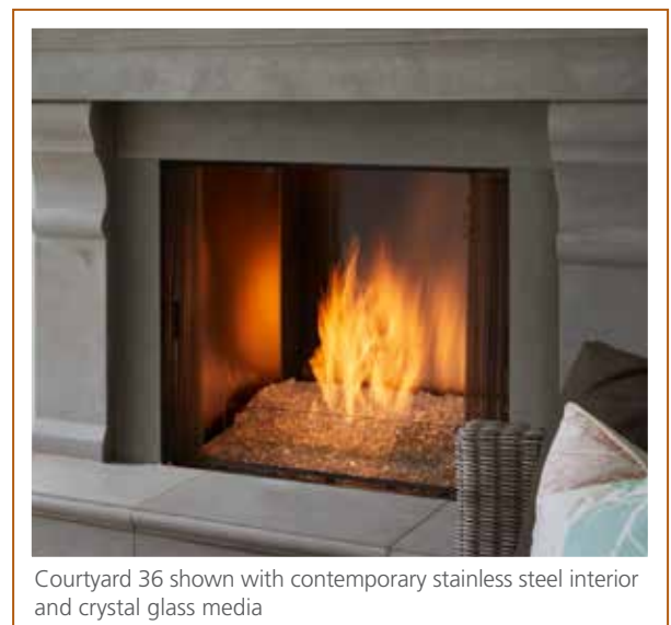
Courtyard 36 shown with contemporary stainless steel interior and crystal glass media