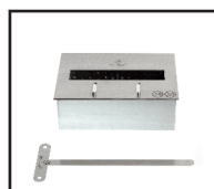
Burner 5L - 5qts insert