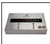
Burner 5L - 5qts