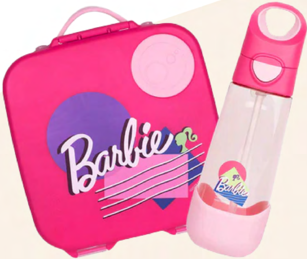
b.box | Barbie™ Lunchbox + Drink Bottle Combo