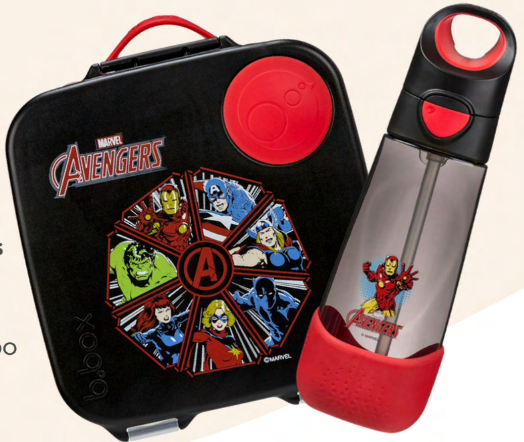
b.box | Avengers Lunchbox + Drink Bottle Combo