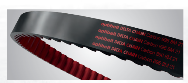
CARBON CORD TIMING ( CHAIN DRIVE ALTERNATIVE