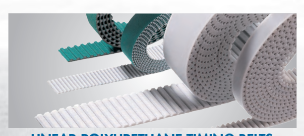
LINEAR POLYURETHANE TIMING BELTS