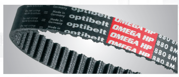
RUBBER & POLYURETHANE TIMING

Optibelt manufactures a complete range of high power industrial performance power transmission products. Contact us to find out the many ways Optibelt products can save your operations time and money.