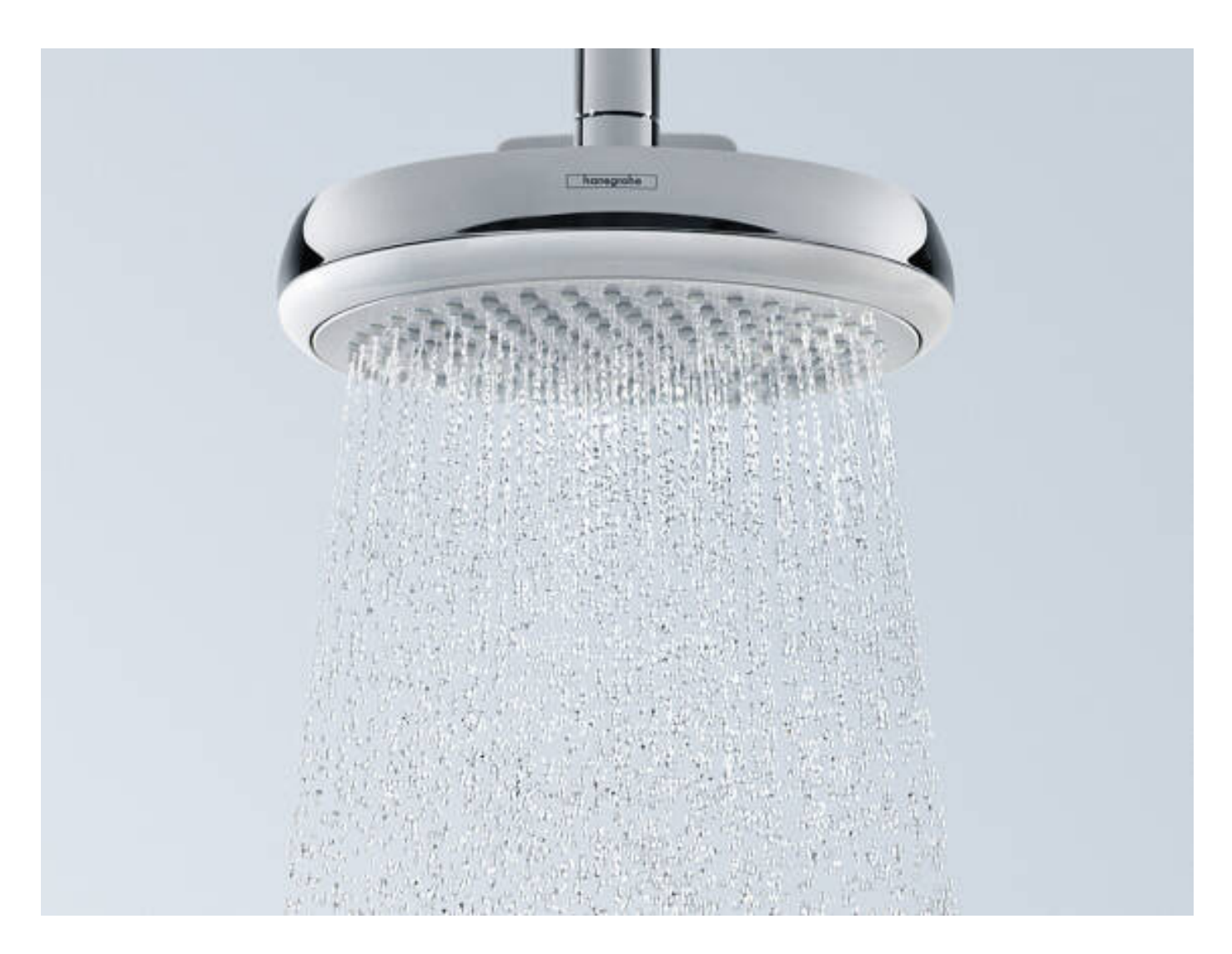
Effective from 1st July 2021