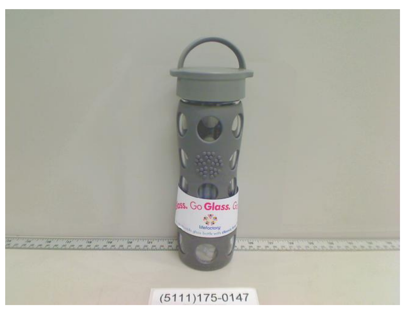
EXHIBIT # 1

LIFEFACTORY INC. Technical Report: (5111)362-0145 January 05, 2012 Page 14 of 15