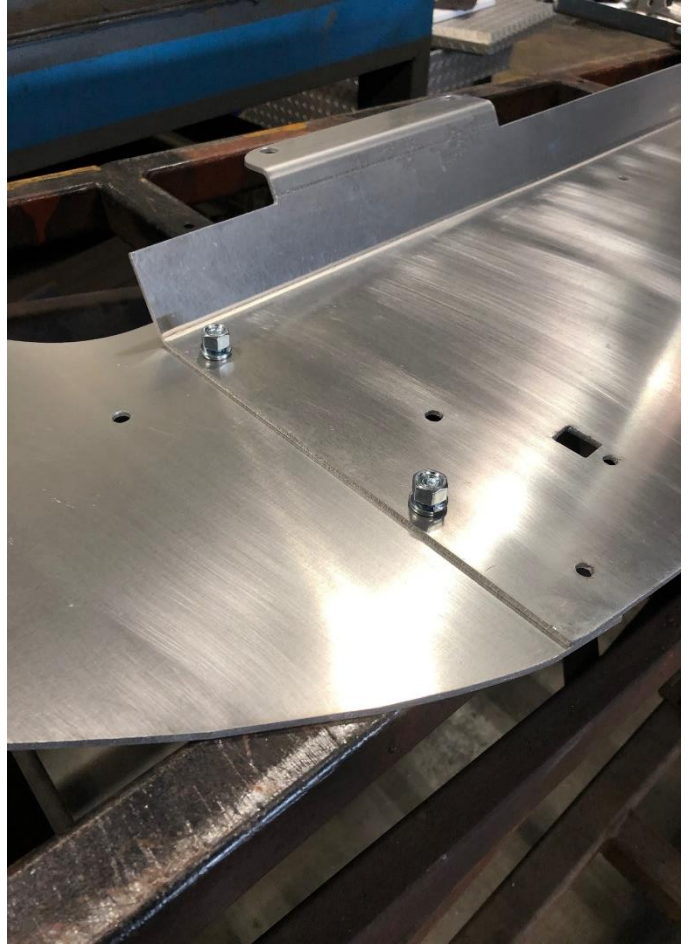
Bolt Position and plate position