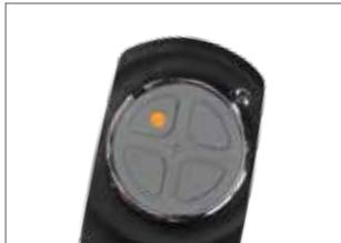
Premium 4 Button PTX6v1 #61228 Black