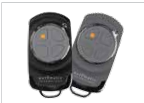
Premium 4 Button