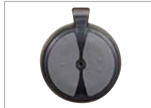
Water Resistant 2 Button PTX2v2 #61169