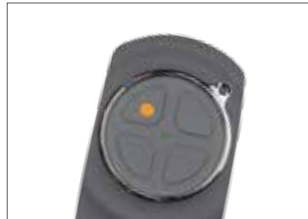
Premium 4 Button PTX6v1 #61229 Grey