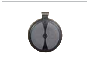
Water Resistant 2 Button