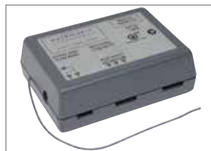
Standalone Receiver 1 Channel #14800