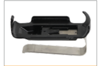
PTX6 Visor Clip Pack #61402