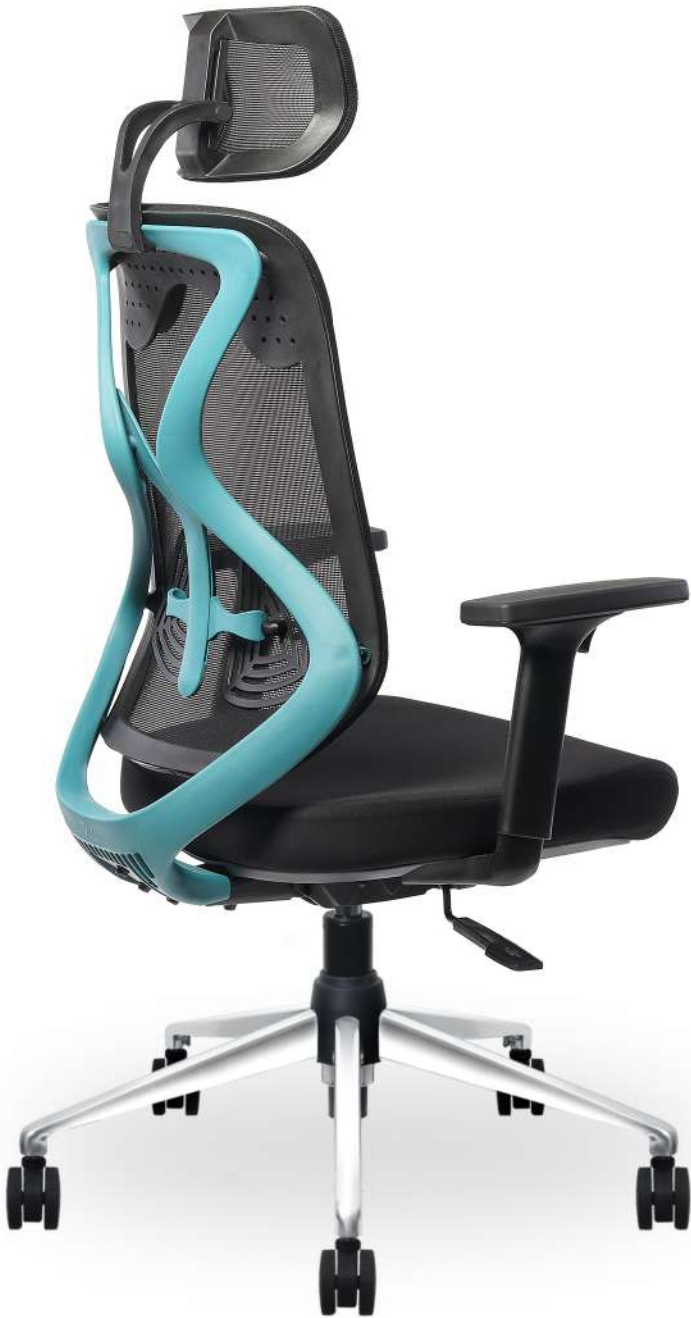
ZEN NORWAY BT