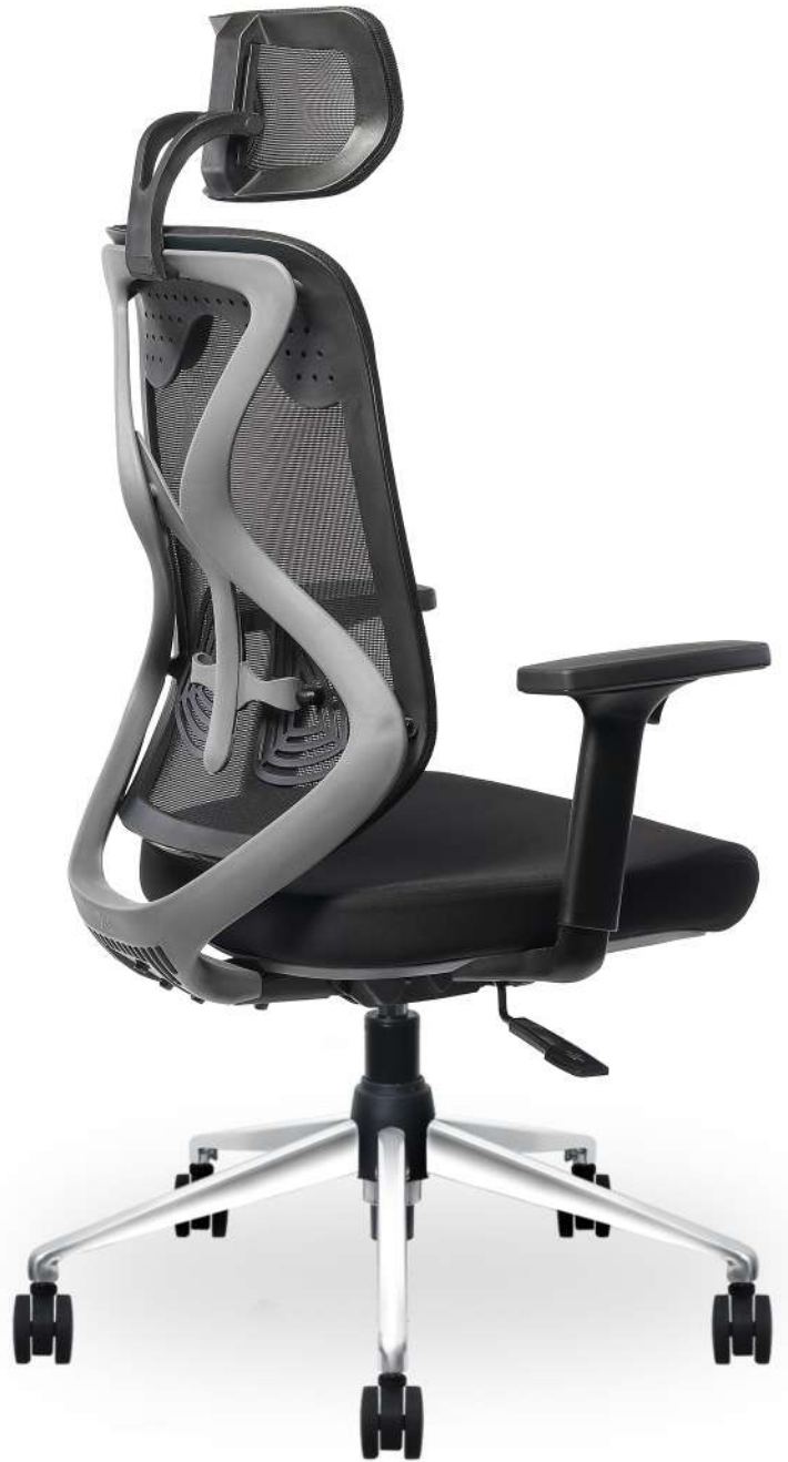
ZEN NORWAY BG