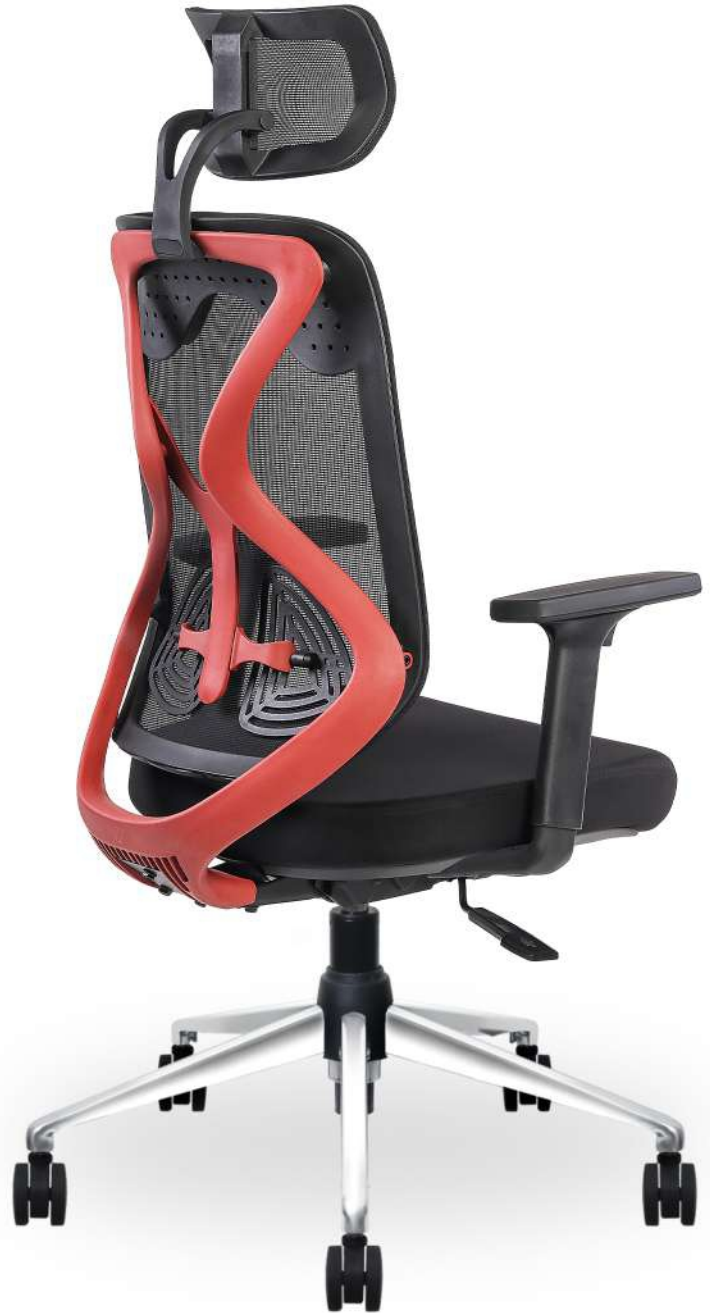
ZEN NORWAY BR