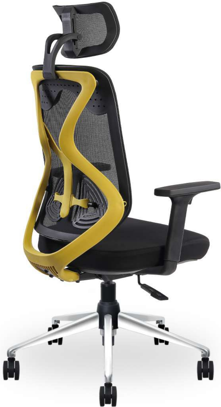
ZEN NORWAY BY