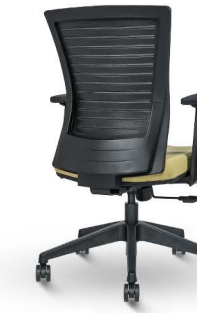
Vino MB All Black Fly ₹7060