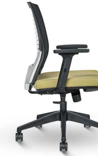
Vino MB LX ₹7460