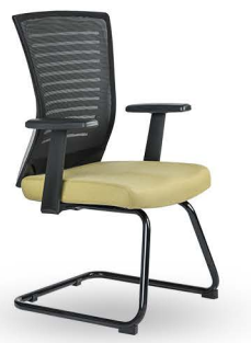
Vino Visitor ₹6060