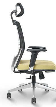
Vino HB Max ₹9950