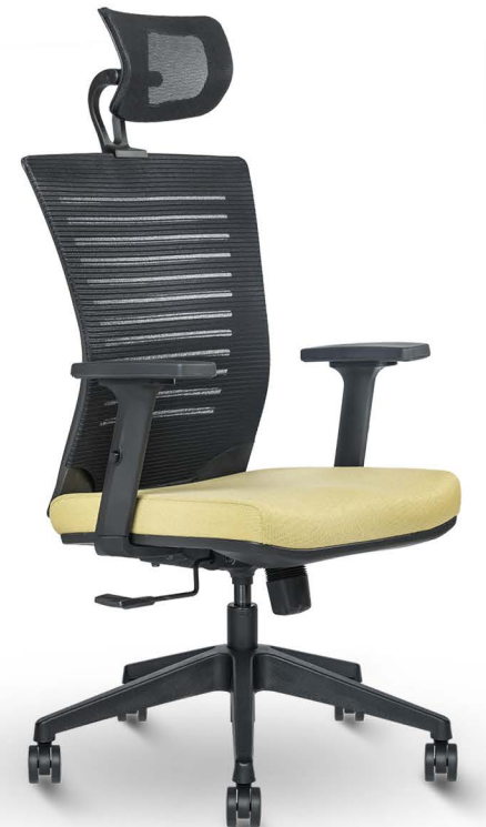
Vino HB LX