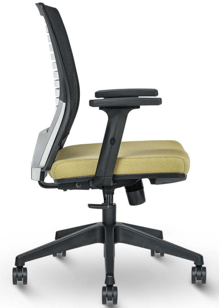
Vino MB LX