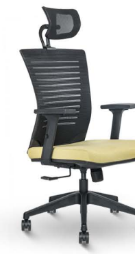
Vino HB LX ₹8460