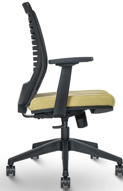
Vino MB All Black Fly

A chair which embraces elegance with a structured back for optimum support