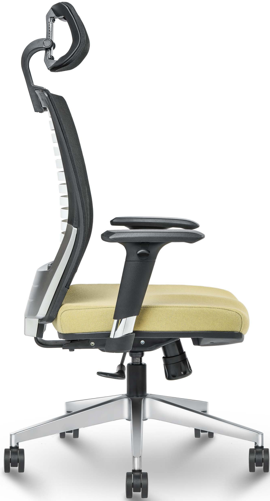
Vino HB Max

A chair which embraces elegance with a structured back for optimum support