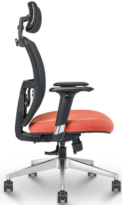
Storm HB Max