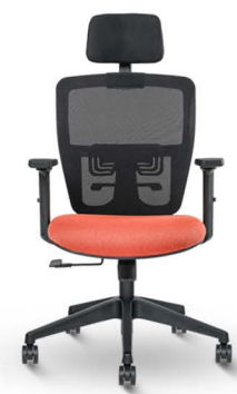
Storm HB LX ₹7900