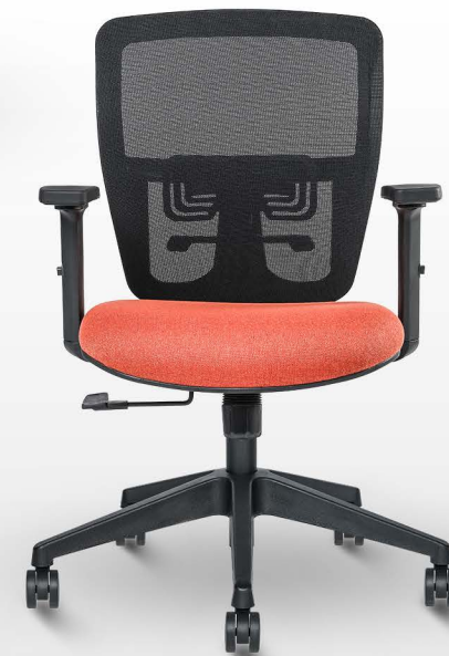
Storm MB LX