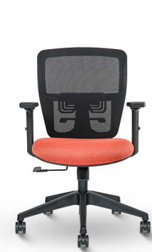
Storm MB LX ₹6900