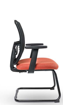
Storm Visitor ₹5400