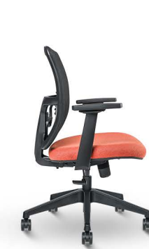
Storm MB Eco ₹6300