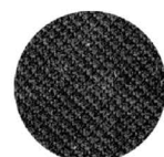
Micro - 11