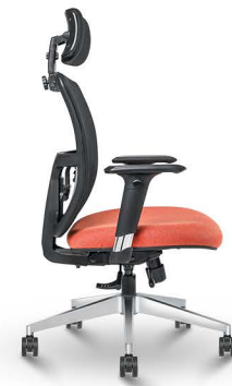
Storm HB Max ₹9300