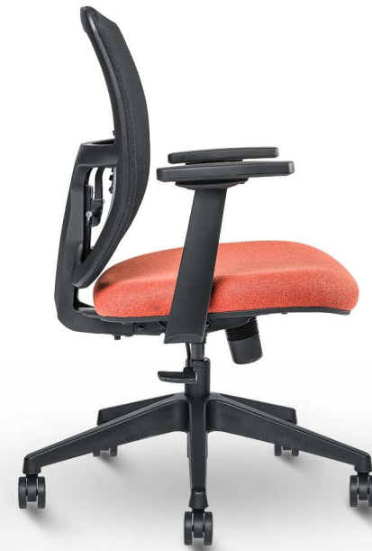
Storm MB Fly