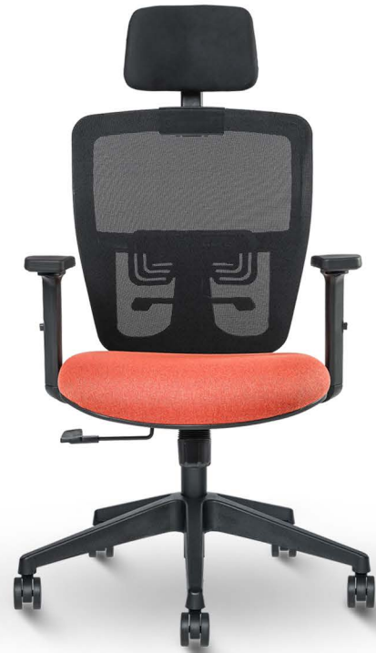
Storm HB LX