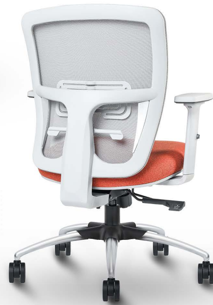
Storm MB Grey