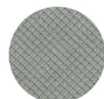
Micro - 12