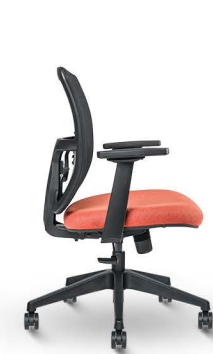
Storm MB Fly ₹6500