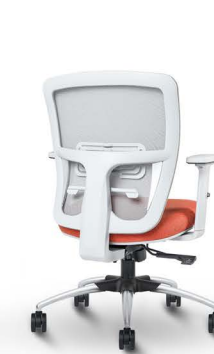
Storm MB Grey ₹9700