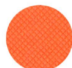
Micro - 05