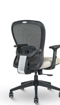
Dune MB LX ₹7100