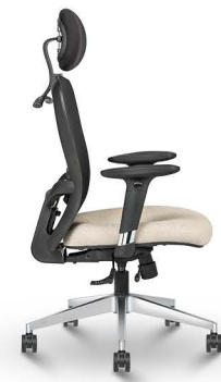
Dune HB Max ₹9950