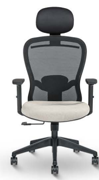
Dune HB LX ₹8300