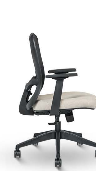
Dune MB Fly ₹6700