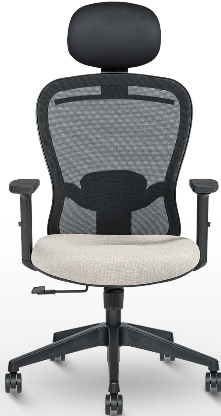
Dune HB Max