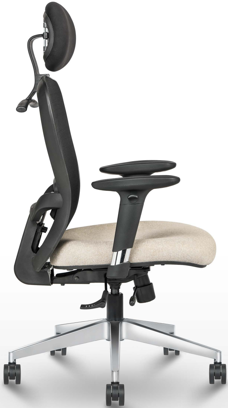
Dune HB LX