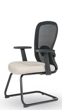
Dune Visitor ₹5700