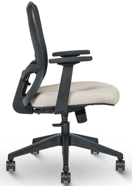
Dune MB Fly