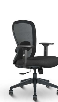
Dune Super ₹5950