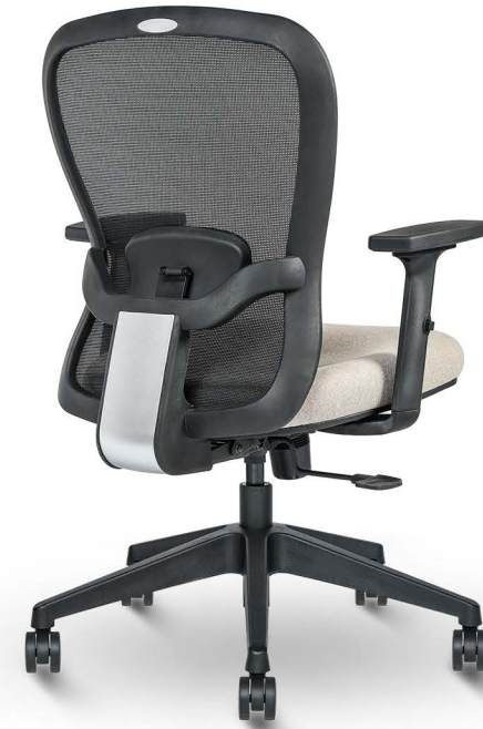
Dune MB LX