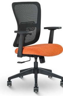
Amigo MB Fly ₹6200