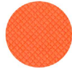
Micro - 05