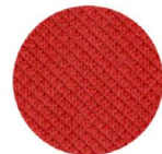
Micro - 08