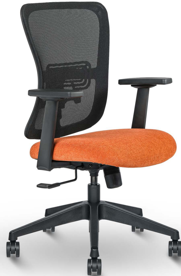
Amigo MB Fly