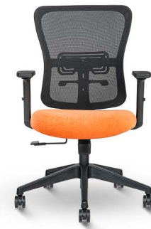
Amigo MB LX ₹6380