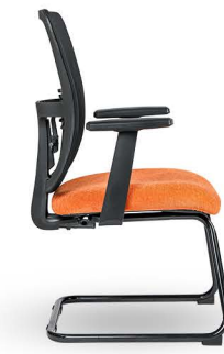
Amigo Visitor ₹5100