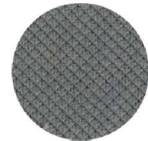
Micro - 06