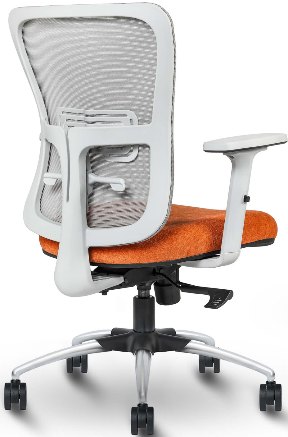
Amigo MB Grey