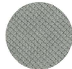
Micro - 12