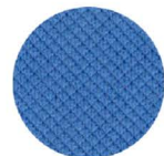
Micro - 07