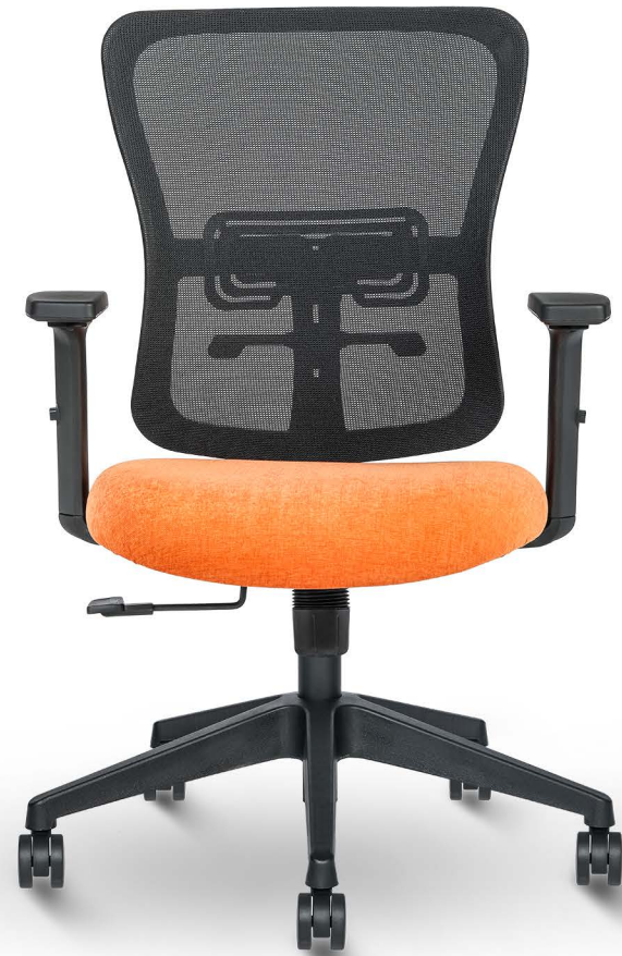
Amigo MB LX