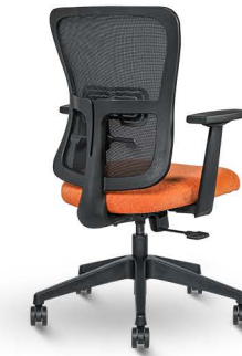
Amigo MB Eco ₹5980