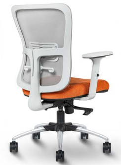
Amigo MB Grey ₹8900