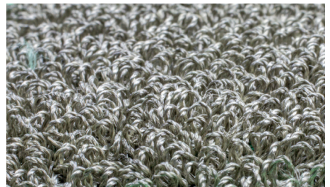
Sensor in moss stitch technology