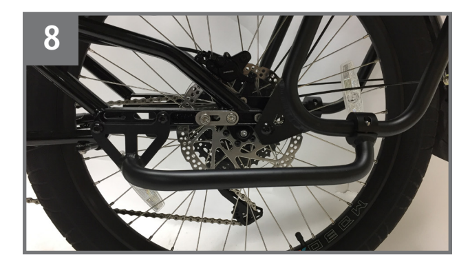
Repeat steps for non-drive side Footsie.