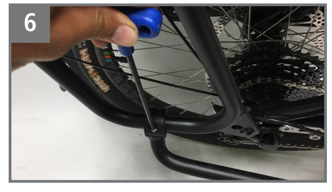
Place upper clamp assembly on the Utility Rack and loosely thread the M8 bolts.