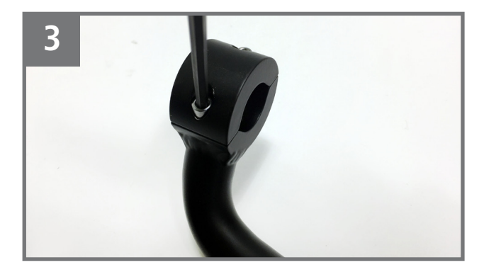
Remove the upper clamp assembly from drive side RFA Footsie.

RFA Footsies are directional. Choose the drive side RFA Footsie first. The mounting plate faces the front of the bike.