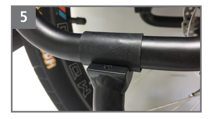
(Optional): Wrap a rubber pad around the Utility Rack at the point where the clamp assembly attaches. You will need to temporarily remove one of the front M8 bolts.