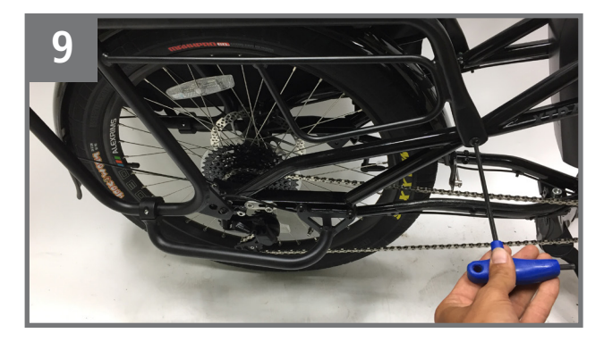
Thread the two rear bolts that connect the Utility Rack to the bicycle frame, then torque all four bolts to 30Nm with a 5mm Allen key.