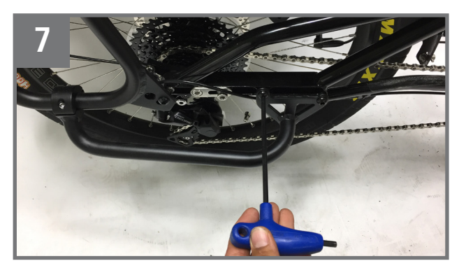
Check for proper threading on all bolts and alternatingly tighten each until the Footsie is secure.