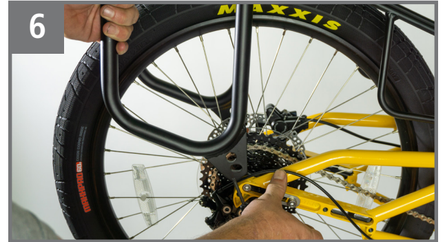
Reinstall the Utility Rack and any accessories previously removed.