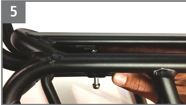
Repeat previous two steps for the rear Hooptie Bracket (labeled "RFA Rear").