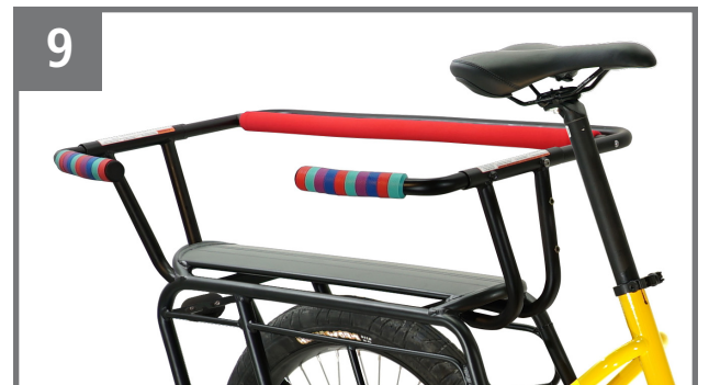
Note: Multiple configurations of Hooptie Rails and/or SnackBars are possible on the RFA in Utility mode. The RFA in Sport mode can have up to two sets of SnackBars.