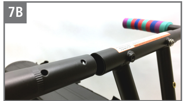
Insert SnackBars to the desired position using the hashed guides for narrow or wide configurations. Tighten both bolts securing the SnackBars to the Brackets.