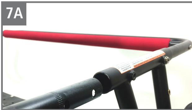
Insert Hooptie Rails to the desired position using the hashed guides for narrow or wide configurations. Tighten all four bolts securing the Rails to the Brackets. Note: Hooptie Rails can only be installed on the RFA Utility