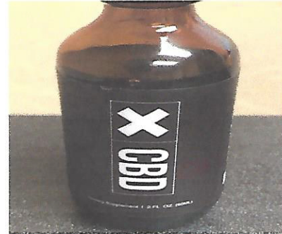
Photo of Sample