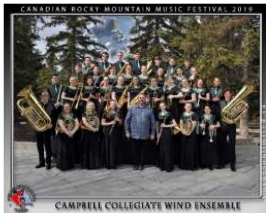
CAMPBELL COLLEGIATE WIND ENSEMBLE