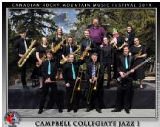
CAMPBELL COLLEGIATE JAZZ 1

We welcome you to join us through your sponsorship.