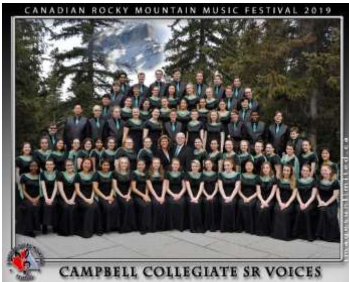
CAMPBELL COLLEGIATE SR VOICES