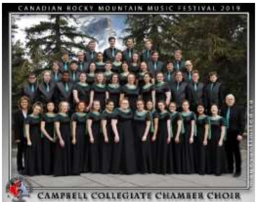
CAMPBELL COLLEGIATE CHAMBER CHOIR