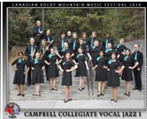
CAMPBELL COLLEGIATE VOCAL JAZZ 1