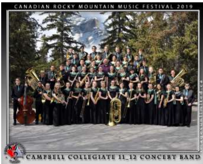
CAMPBELL COLLEGIATE 11_12 CONCERT BAND