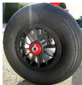
Unsecured Snap Button