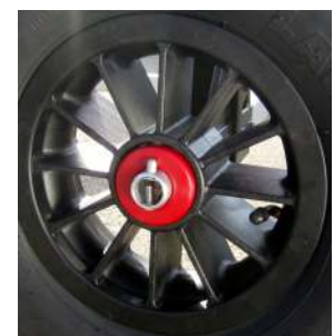
Snap Button Immobilized