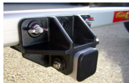
Wing Nuts for Quick Disconnect