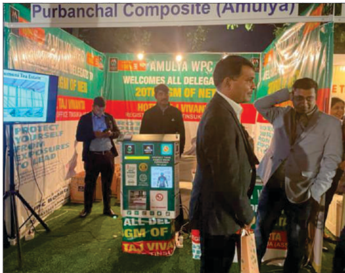
Exhibition of WPC held at Vivanta Guwahati