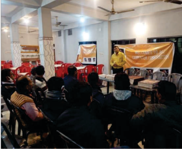
Balurghat, North Bengal