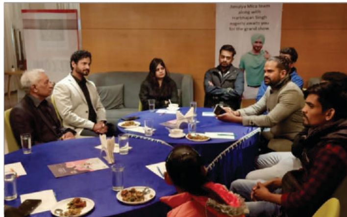
Guna, Madhya Pradesh