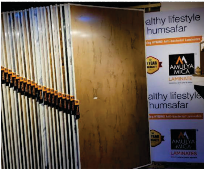
NAME : THREE STAR PLY LOCATION : DIBRUGARH, ASSAM

Amulya Mica opens New Shoppe at Dibrugrah, Hubli, Sambalpur and Tinsukia