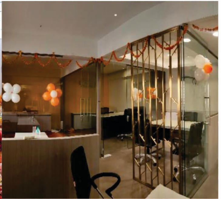
Opening Ceremony of newly designed Sales & Marketing office at Gandhidham