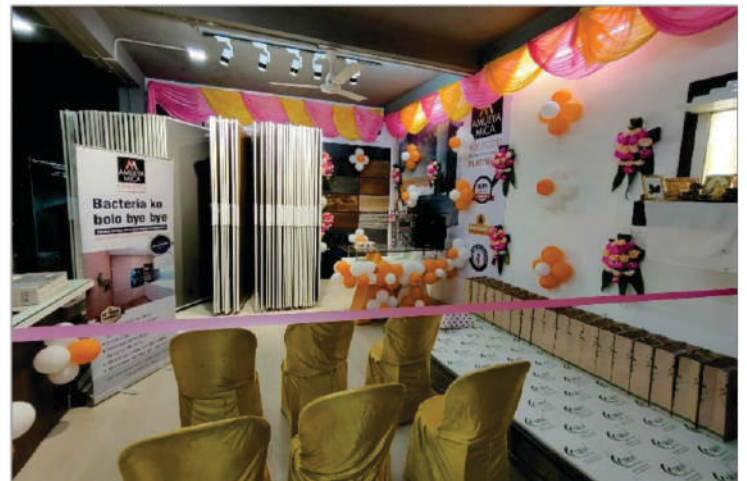
NAME : SHREERAM GLASS & DECOR LOCATION : TINSUKIA, ASSAM