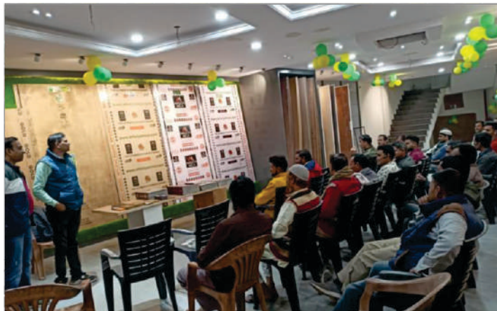
Guna, Madhya Pradesh