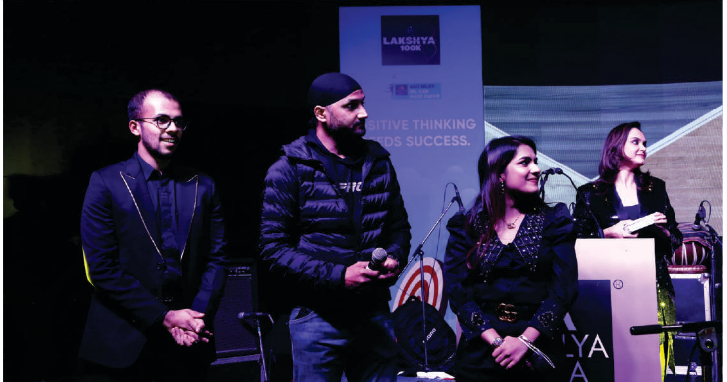
Imperial Premium Laminate Collection Launched by the Legendary Cricketer Harbhajan Singh