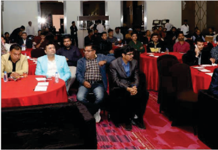
Amulya Mica organised Dealer Meet on 27 th November at hotel Marriott, Indore along with New Plywood Center.

Amulya Mica Organised Dealer Meet at Indore & Gurugram.