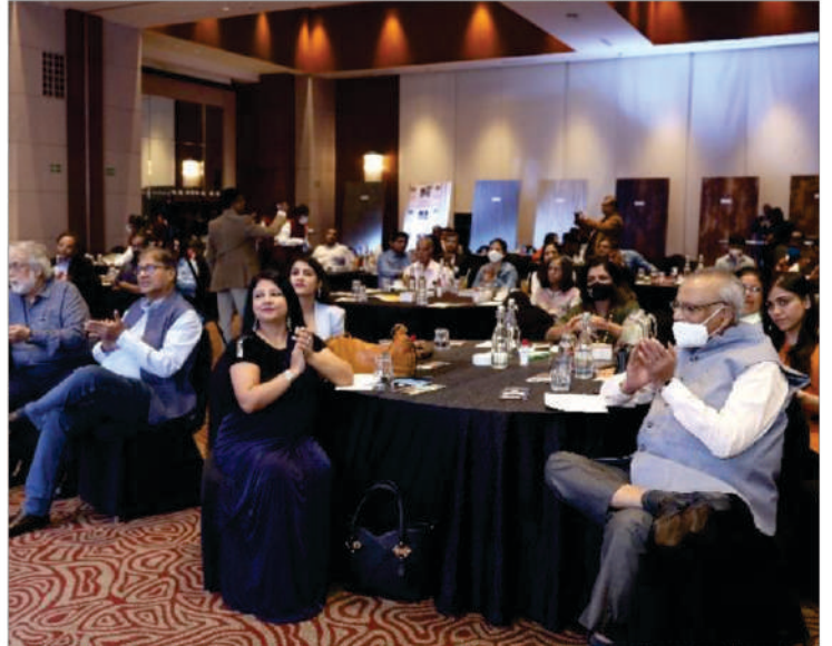
Kolkata, West Bengal