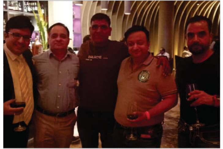
Amulya Mica organised Dealer Meet on 27 th October at hotel The Westin, Gurugram along with Sunshine Plywood.