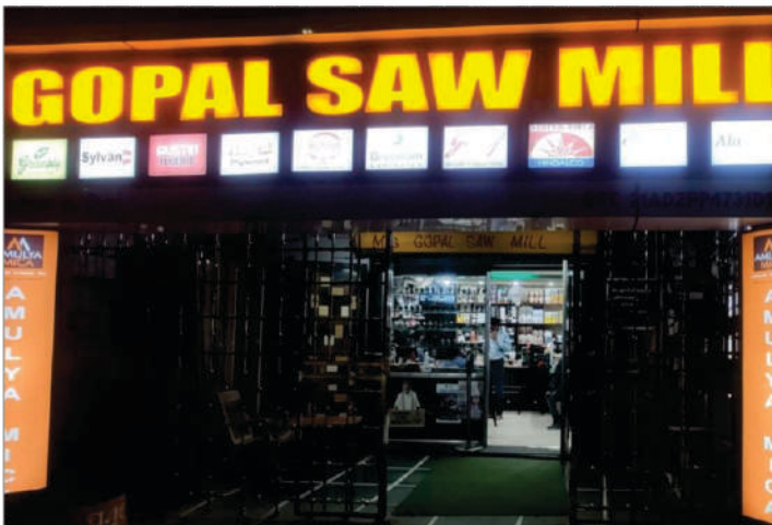
NAME : GOPAL SAW MILL LOCATION : SAMBALPUR, ODISHA