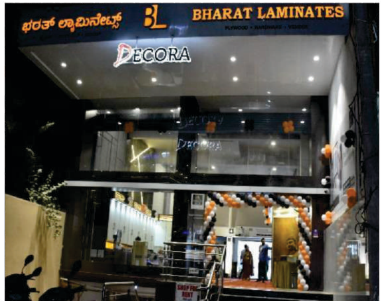
NAME : BHARAT LAMINATES LOCATION : HUBLI, KARNATAKA