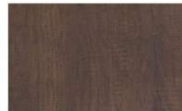
EX 3150 SF Canyon Monument