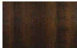
3191 RE-14 BROWN OAK