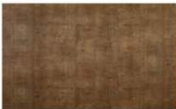
E 121 SC GAUN TREE