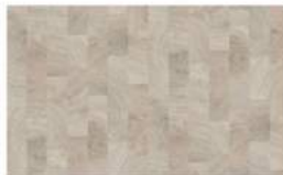
E 129 WL Westminster Oak Light