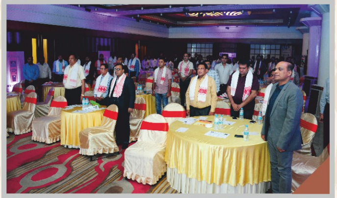
Gauhati, Assam Dealers Meet in association with our distributor Mangalam Associates & Trade Well (Assam), of Gauhati, Assam on 17-Mar-18.