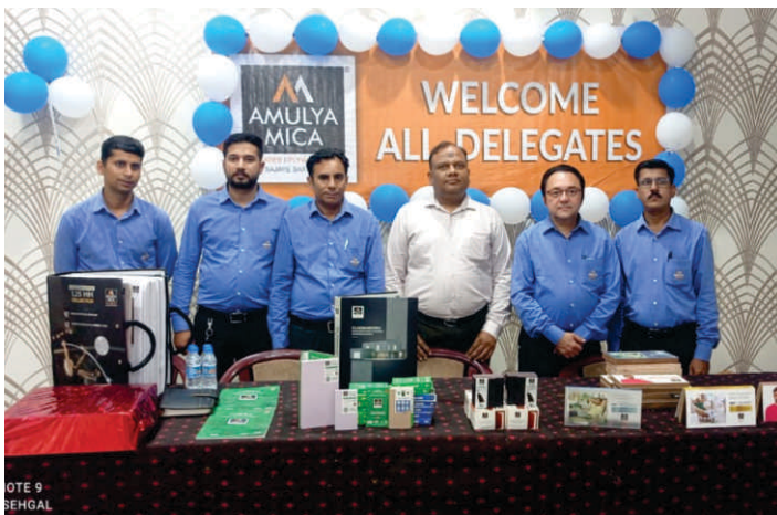
Ambala Club, Ambala (Haryana) on 16.08.2023