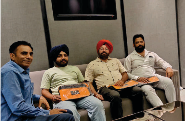
Salig Ram Om Prakash, Ludhiana on 01.08.2023