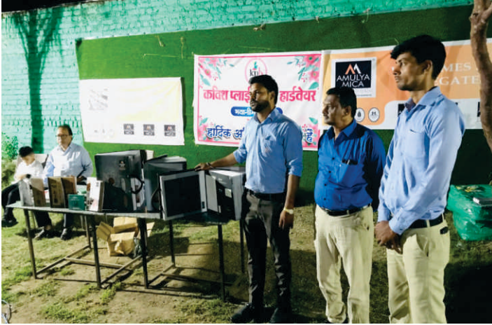
Bhawani Mandi (Rajasthan) on 11.08.2023