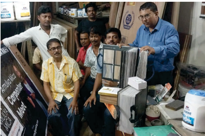
Nandi Timber At South Kolkata on 14.10.2023