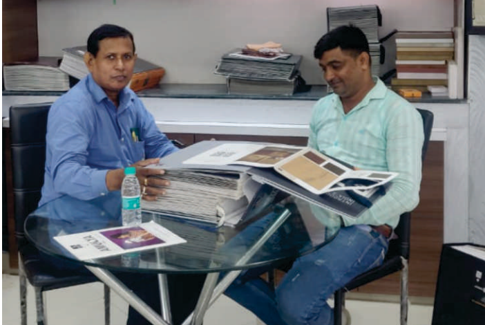
Kolkata Studio From 21.08.23 to 23.08.2023