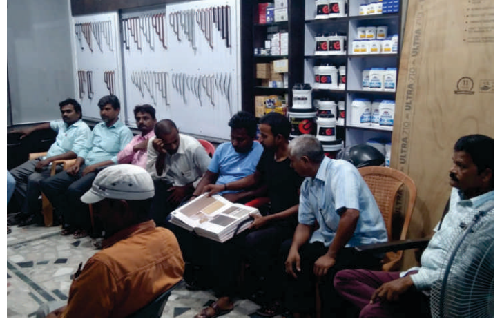
Yadav Hardware And Plywood Center At Azamgarh Uttar Pradesh On 28.07.2023