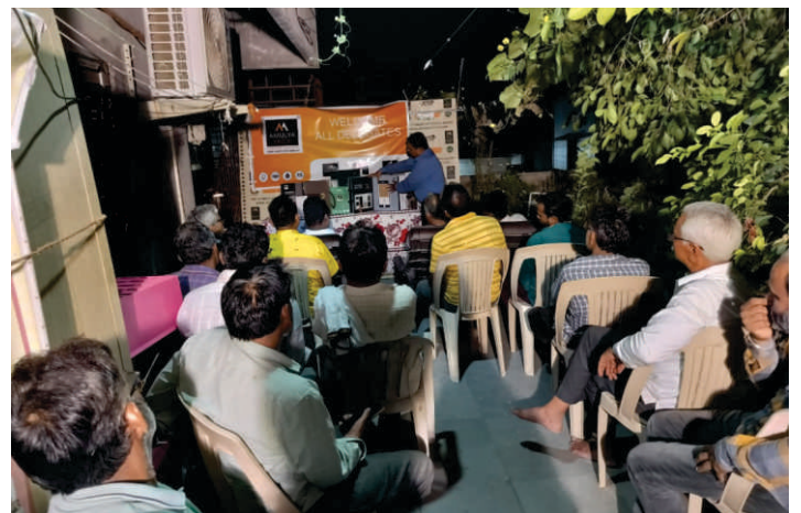
Jangid Glass & Fabrication, Akola, on 22.08.2023