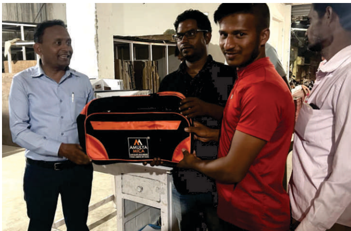
Shandilya Decor Pvt. Ltd., Daltonganj on 28.10.2023