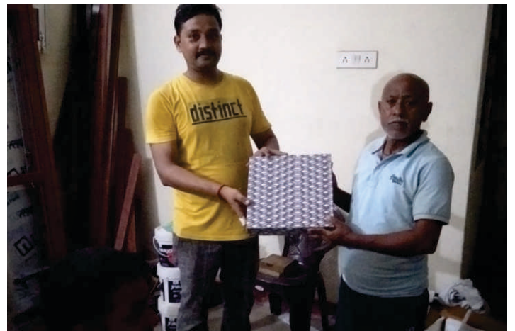
Mahadev traders at Sakaldiha Chandauli, Uttar Pradesh on 29.07.2023

Amulya Mica organized in-shop Contractor and Carpenter meets at numerous location in india, offering a platform for professionals to share ideas, learn about industry trends, and experience Amulya Mica's products firsthand through live demonstrations. These events encouraged networking, collaboration, and skill enhancement. They exemplified Amulya Mica's commitment to empowering construction and interior design professionals while celebrating their expertise