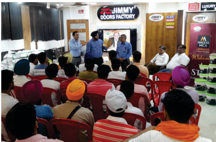
Rampura Phull (Punjab) on 26.08.2023