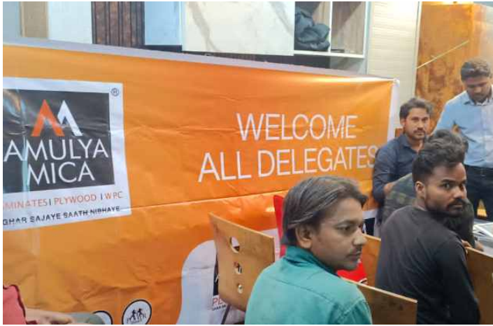
Raghavendra Glass And Plywood Bangalore on 04.07.2023