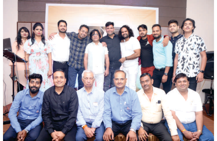
Hotel Varun, Guna, Madhya Pradesh on 04.08.2023