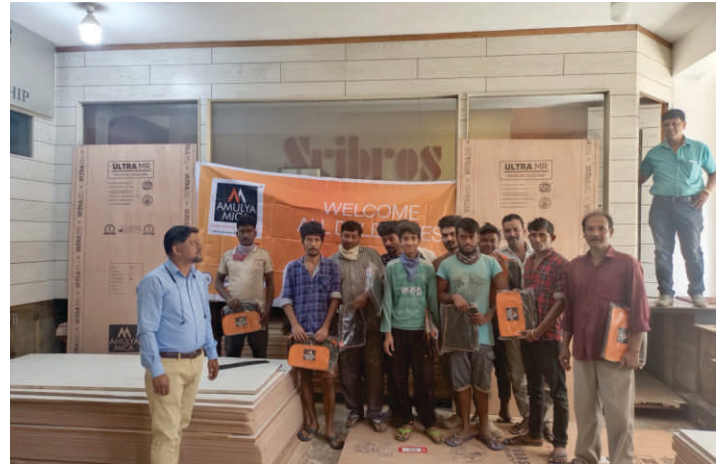
Sri Bros interior Bangalore on 30.08.2023