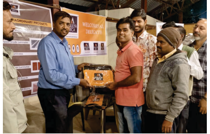
Roshan Glass & Plywood, Junnar, Pune on 11.08.2023