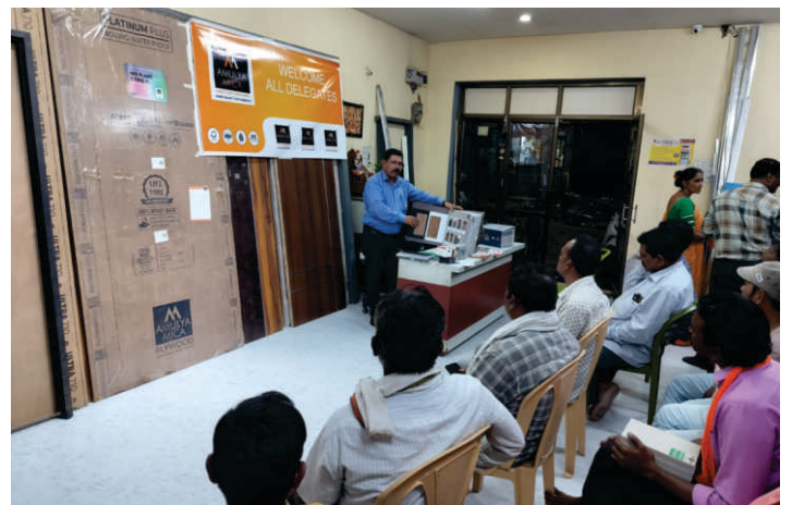
Peshwai Furniture, Akola on 06.10.2023