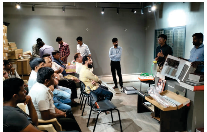
SK Agencies, Chennai on 18.05.2023