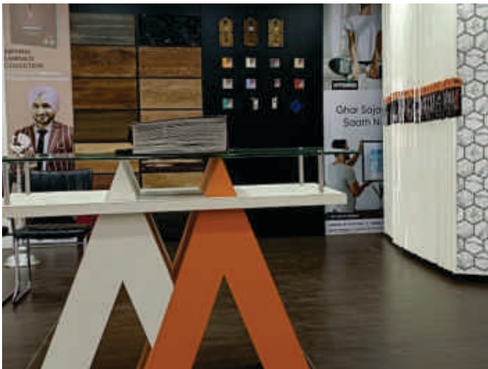
Name: - Right Way Decor Location: - Bengaluru, Karnataka