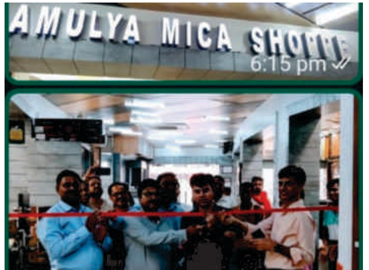
Name: - City Ply & Glass House Location: - Muzzaffarpur, Bihar