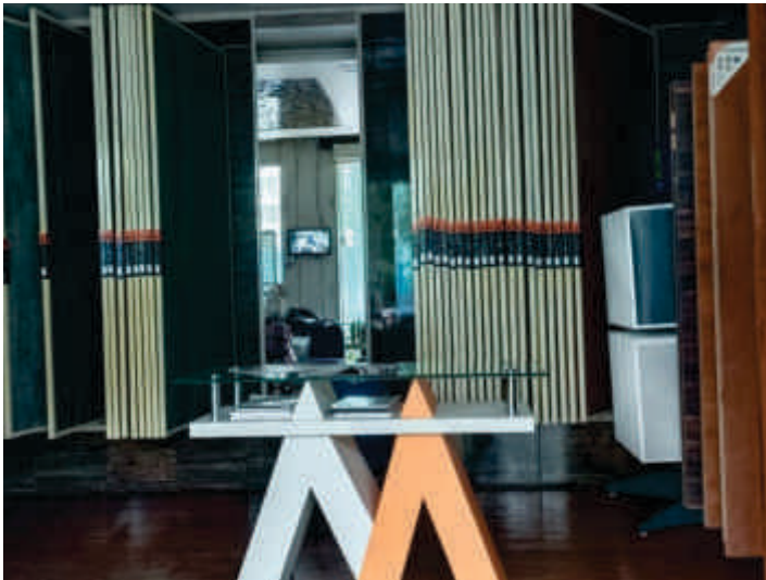
Name: - Shiv Enterprises Location: - Bengaluru, Karnataka

Amulya Mica Shoppe are exclusive Amulya Mica Gallery, & shop in shop stores opening up across the length and breadth of the country, to serve their customers with huge range, variety and altogether a unique shopping experience. Up till now 33 shoppe are operational and Amulya Mica plan to open 100 such shoppes.