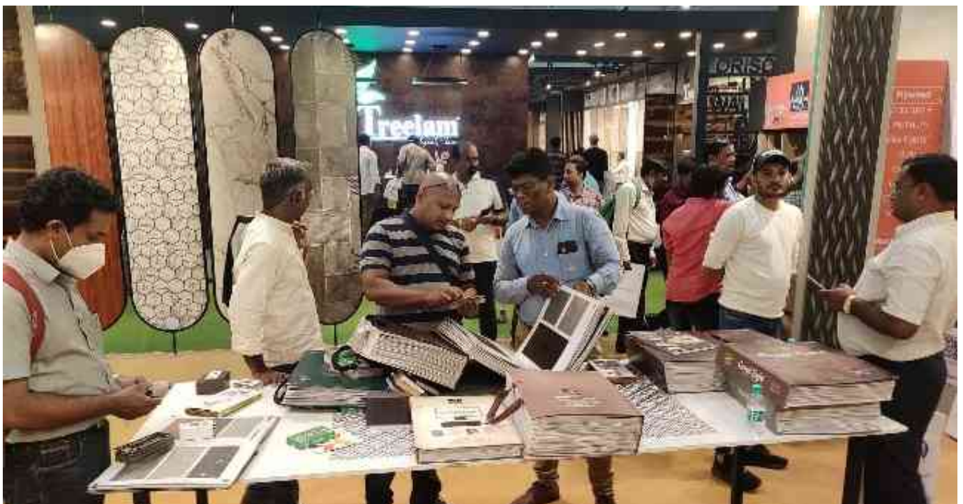
Amulya Mica @ India Wood, Bengaluru - 2022