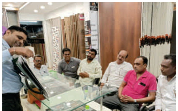
Saharanpur, Uttar Pradesh