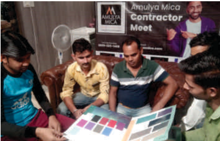
Kanpur, Uttar Pradesh