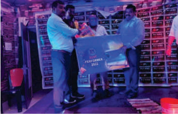
Belda, West Bengal