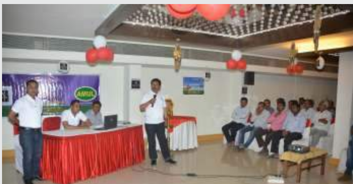
Akola, Nagpur(Maharashtra) - Contractor Meet