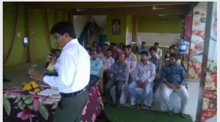
Nagada, M.P. – Contractor Meet at Navakar Plywood, Nagada, M.P.