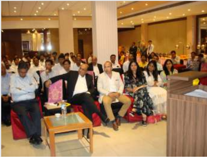
All India Sales Meet at Ahmedabad from 28-Apr-16 to 30-Apr-16