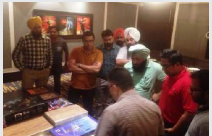
Ludhiana - Get-together on July'16