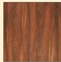
RE-3 3072 Orange Agate