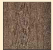
RE-4 3074 Cured Ash