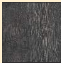
RE-3 3039 Dark Hickory