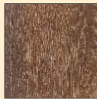
RE-2 3040 Natural Hickory