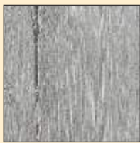
RE-2 3038 light Hickory