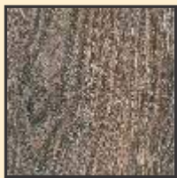
RE-1 3058 Exotic Elm

In Synchronised Laminates, grain & textures are truly matched with natural wood textures. One can feel touch sensation of exact texture of natural veneer. It is manufactured with laminate press plate, design of which is synchronized laminates gives the real feeling of natural wood even in look & touch just like wood veneer. It is highly resistant in burns & stains as well as low maintenance as compared to natural veneer. It can be used anywhere as regular laminates. It is available in thickness of 1.25mm with 24 design papers and in size of 8'x4'. For more information check website www.amulyamica.com