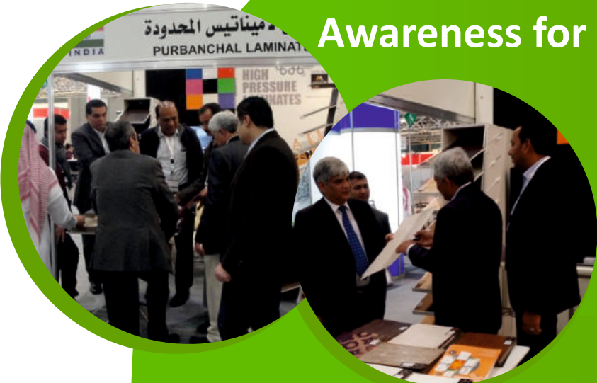
Exhibition At RIYADH (17-20 Feb/2014)