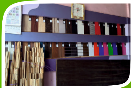
Indore: Decorated Amulya Mica A x 4 size samples in Royal Plywood, Indore.