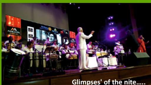
Glimpses' of the nite.....

On 1 st Mar-2015 , Rotary Club , Bangalore had organized Laxmikant Pyarelal Nite in Christ University auditorium ,Hosur Road, Bangalore for charity purpose to medical help of Orphanage. Amulya mica was Co-sponsor with Rotary club for this noble cause.