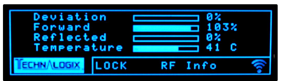
OLED Display Screen