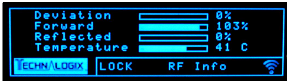
OLED Display Screen