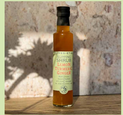
Lemon, Turmeric, Ginger

Apple Cider Vinegar steeped with Honey, Lemon, Turmeric & Ginger