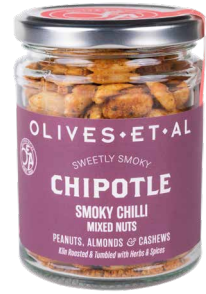
Chipotle Smoky Chilli Nuts ★ Kiln Roasted Peanuts, Almonds & Cashews tumbled with Smoked Chilli & Garlic.