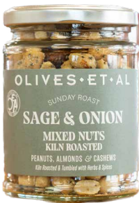
Sage & Onion Nuts Kiln Roasted Peanuts, Almonds & Cashews tumbled with aromatic Sage & Onion flavour.