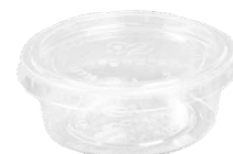
Deli Pots & Lids