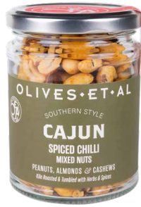
Cajun Spiced Chilli Nuts Kiln Roasted Peanuts, Almonds & Cashews tumbled with Chilli, Garlic & Herbs.