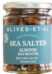
Sea Salted Almonds Kiln Roasted Almonds tumbled with flaked Sea Salt.