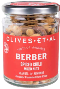
Berber Sweet Chilli Harissa Nuts ★ Kiln roasted Peanuts & Almonds tumbled with North African Harissa.

Retail Options pictured and listed in Black. Food Service options listed in Red - useful