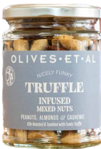
Truffle Infused Nuts ★ Kiln Roasted Peanuts, Almonds & Cashews tumbled & infused with real Truffle.