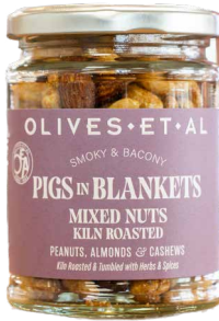
Pigs in Blankets Nuts ★ Kiln Roasted Peanuts, Almonds & Cashews tumbled with a smoky, bacony flavour.