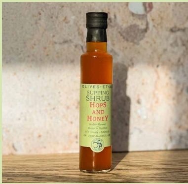
Hops & Honey

Apple Cider Vinegar steeped with Hops, Honey & Botanicals