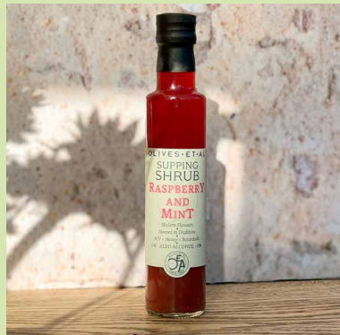
Raspberry & Mint

Apple Cider Vinegar steeped with Honey, Raspberry & Mint