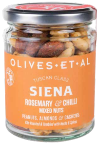
Siena Rosemary & Chilli Nuts Kiln Roasted Peanuts, Almonds & Cashews tumbled with Tuscan style Rosemary & Chilli.