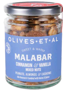
Malabar Cinnamon & Vanilla Nuts Kiln Roasted Peanuts, Almonds & Cashews tumbled with a Cinnamon & Vanilla glaze.