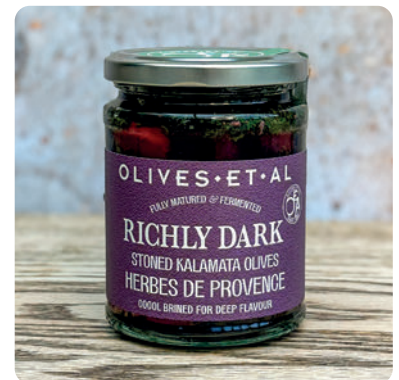
Richly Dark Pitted Kalamata ★ Stoned Kalamata Olives in Brine with Herbes de Provence topped with Oil