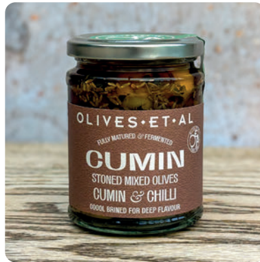
Cumin & Chilli - Mixed & Stoned ★ Stoned Mixed Olives in Brine with Cumin, Chilli and a little Mint topped with Oil