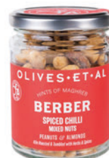
Standard 300ml Jar for Olives & Nuts 100mm Tall x 74mm Dia