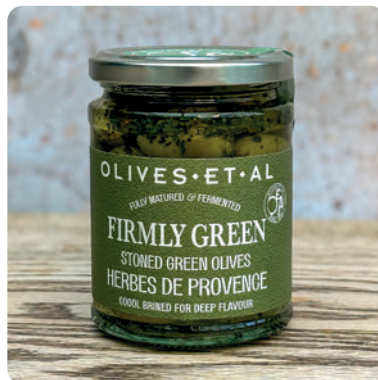
Firmly Green - Green & Stoned Stoned Green Olives in Brine with Herbes de Provence topped with Oil