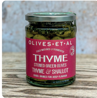
Thyme & Shallot - Green & Stoned ★ Stoned Green Olives in Brine with Thyme, Shallot and a touch of Lemon topped with Oil