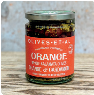
Orange & Cardamom - Whole ★ Whole Kalamata Olives in Brine with Orange and Cardamom topped with Oil