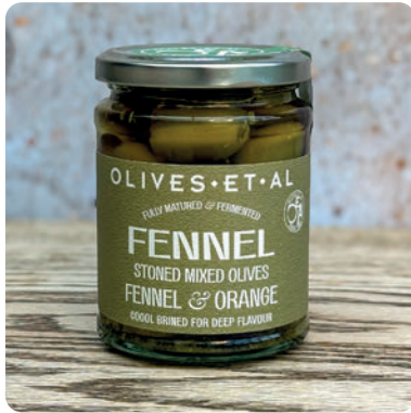
Fennel & Orange - Mixed & Stoned Stoned Mixed Olives in Brine with Fennel and Orange topped with Oil