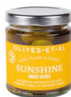
Smaller 200ml Jar for Olives & Nuts 82mm Tall x 66mm Dia