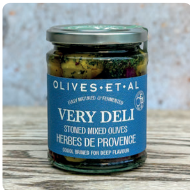
Very Deli - Mixed & Stoned ★ Stoned Mixed Olives in Brine with Herbes de Provence topped with Oil