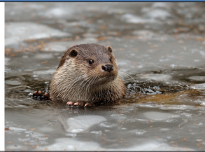
Blue Series - Book 7: River Otters

In winter, river otters still go swimming! The water is chilled, so they tend to swim in the day when the sun is up, and sleep in a den when the sun sets.