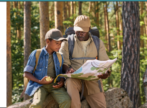
Teal Series - Book 5: The Campint Trip

They stopped and had a rest. Cole had a snack while Granddad checked the map. The lake was close by!