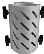
Part A Bottom bracket