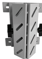
Part B Top bracket