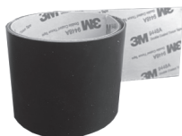
3M coated tape